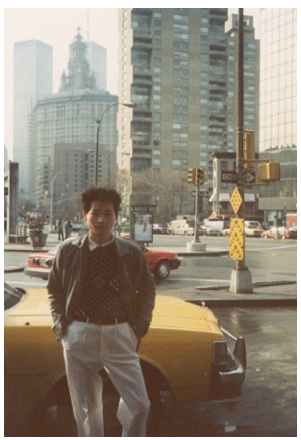
New York City. I spoke no English when I came to America.