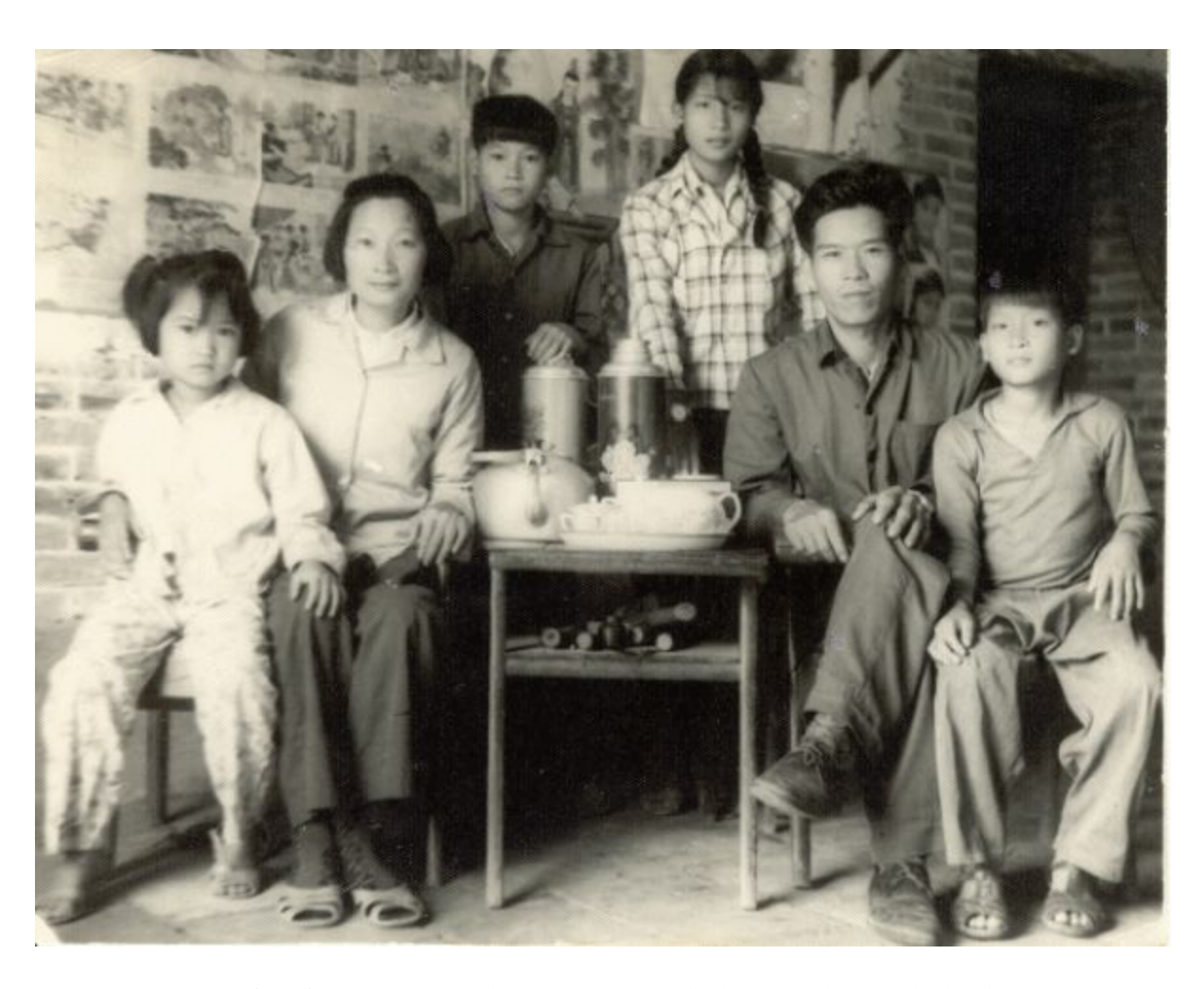
My first family picture taken in 1983. I'm the boy standing in the back.